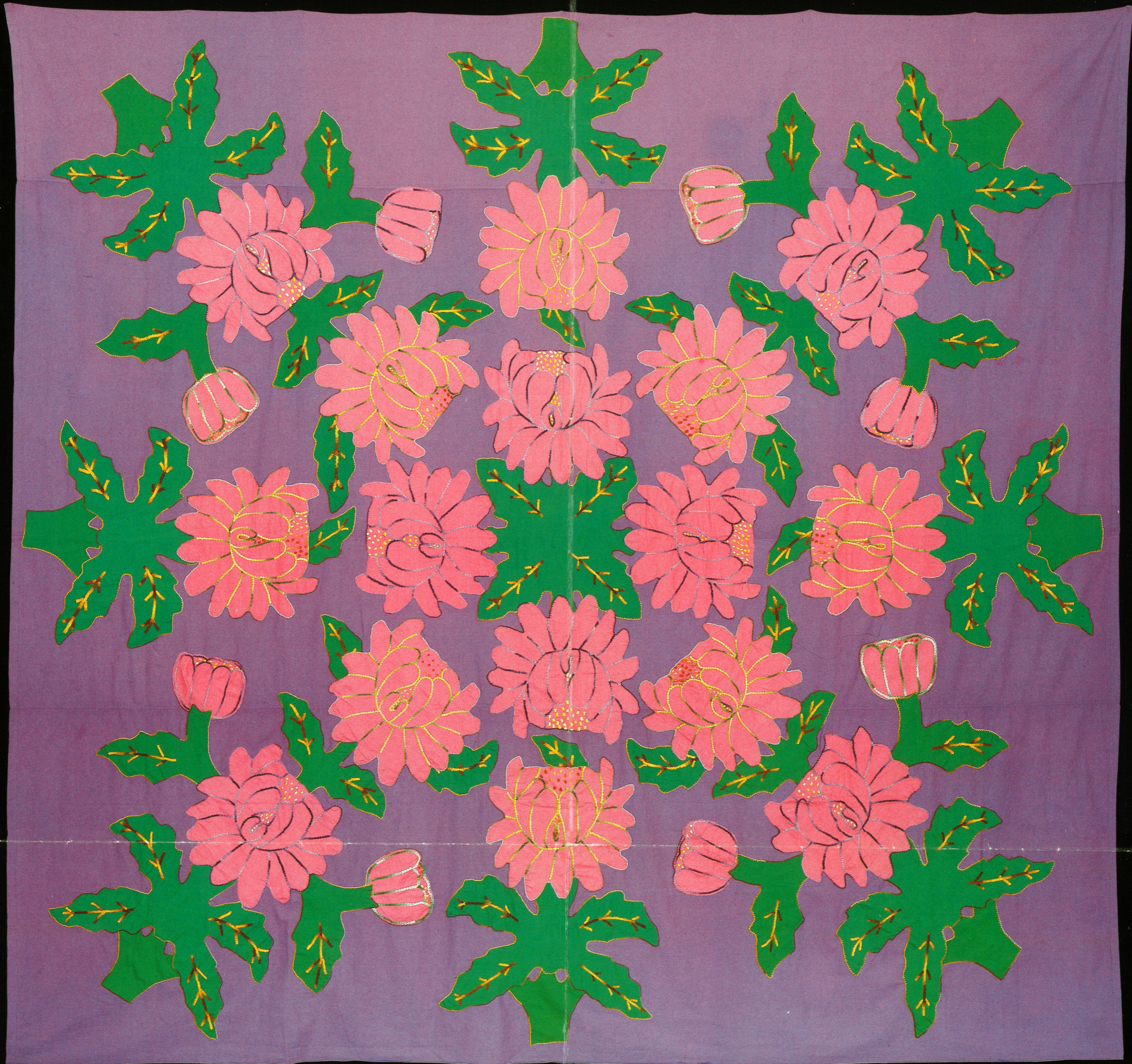
Chrysanthemum Tivaevae (casement cotton and embroidery thread, 2650 x 2820 mm) handworked by the Kuki Airani Angaanga Tupuna Trust, Otara, Auckland