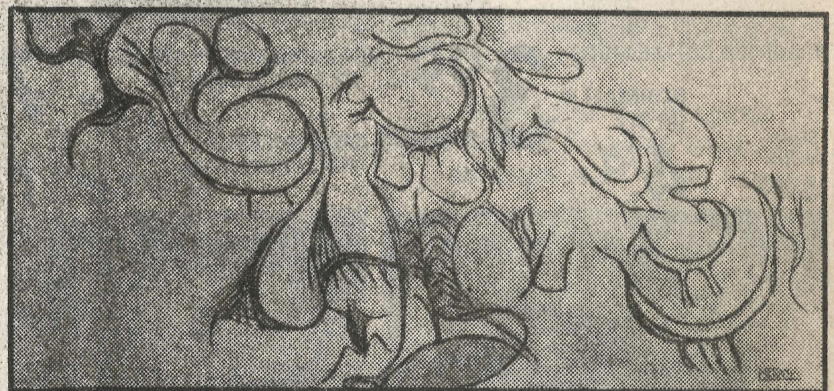
Rock drawing painting by Merania Paora.