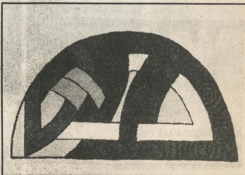
Wool wall hanging by Maude Cook.